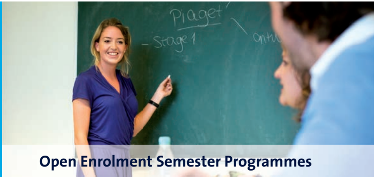
Open Enrolment Semester Programmes